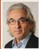
Phil Fontaine Former National Chief of the Assembly of First Nations and Current President – Ishkonigan Inc. (Canada)