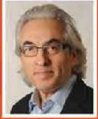
Phil Fontaine Former National Chief of the Assembly of First Nations and Current President – Ishkoniqan Inc. (Canada)